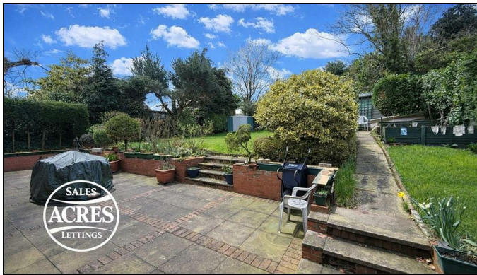
Petershouse Drive, Sutton Coldfield, B74 4XN